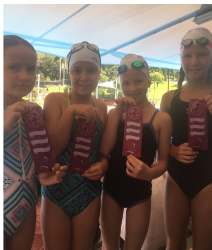
Girls Junior Relay Team came second & qualified for regional carnival