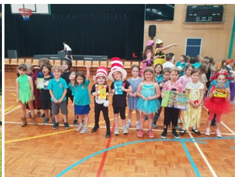
Students and staff dressed up for our annual Book Parade