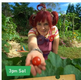
Guest appearance by the gumboot wearing, planet-loving TV star dirtgirl!