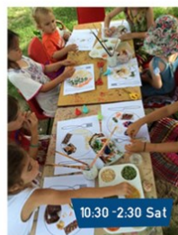
Fun and imaginative craft activities using sustainable, recycled and nature based materials!