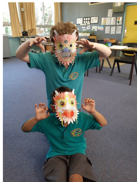
K6G students with their Chinese dragon masks.

A key program in our three year school plan is instigating visible learning in classrooms, based on Professor John Hattie's work. The aim is to ensure all students know what they are learning, why they are learning this, and how they know they are successful. On Tuesday a team will be visiting our school to assess current practices in the school with a view to planning for further improvement.