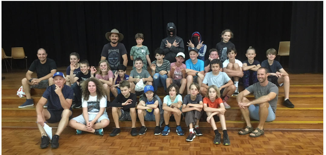
2018 year 6 boys camp out