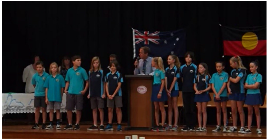
School captains and vice captains from 2018 and their 2019 successors