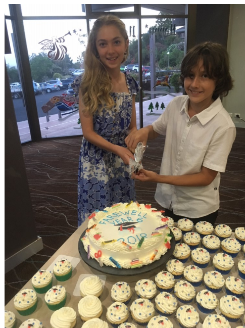
Farewell and all the best to our year 6 students