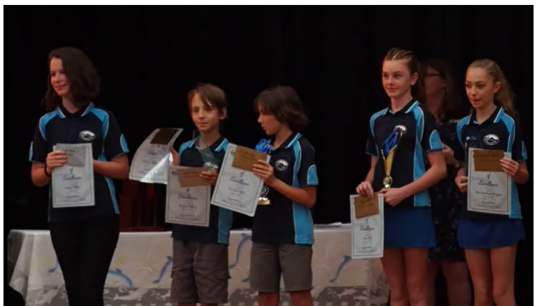
2018 Dux of the school award