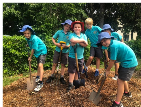
Preparing the garden beds. See more photos over the page.