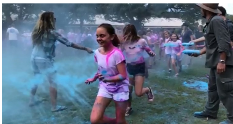
Students, parents and staff taking part in last term's hugely successful colour run.