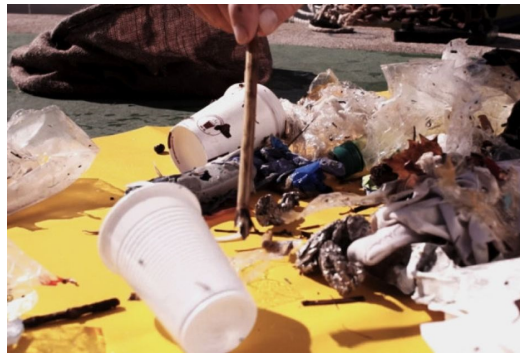
Rubbish collected by the SeaBin Project.

Parents and families are most welcome to attend on Thursday 9th May from 1-2pm in the school hall.