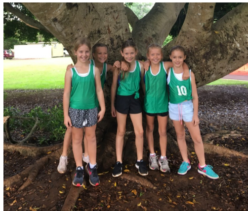
Congratulations to all our students who competed at district cross country last week.